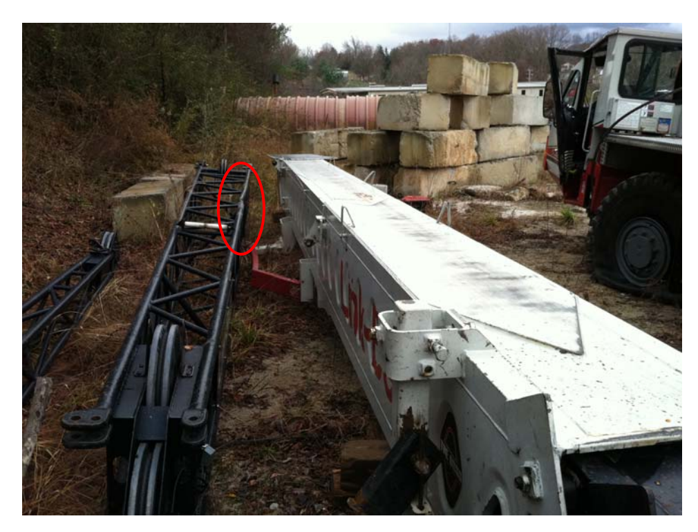
Photo #15: View depicting boom and jib. Damage to jib from impact. No visible damage to boom.