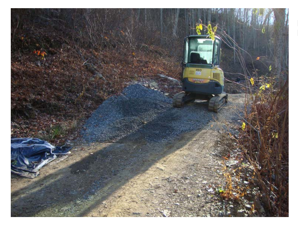
Photo #22: Insured will need to build up driveway in order to bring in (2) 70-ton cranes for recovery.

Photo #21: Insured's work included the truss erection for homeowner's new building on mountain site.