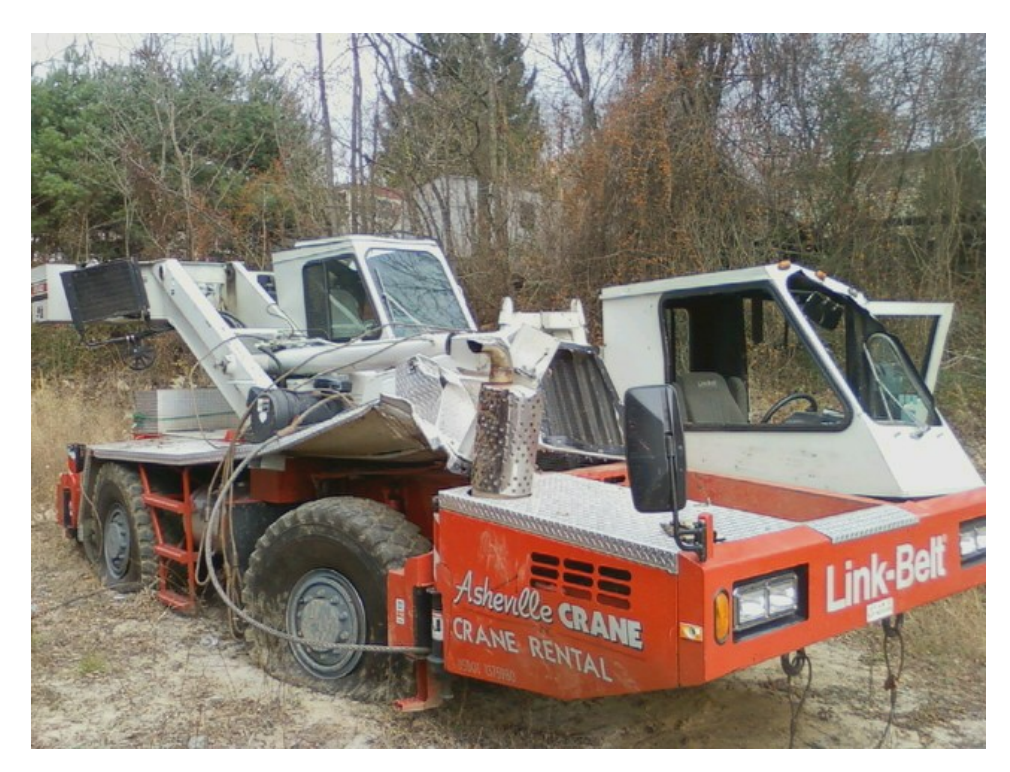
Photo #13: Right side view of boom truck recovered from site. Boom has been removed.