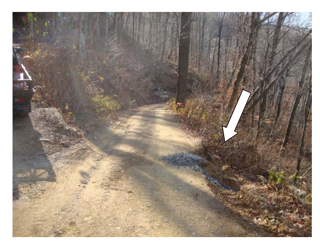
Photo #20: View of loss location. Insured was operating unit down driveway, hit soft spot and rolled over down mountain approx. 20'.

Photo #19: Radiator/Cooling system sustained damaged from impact.