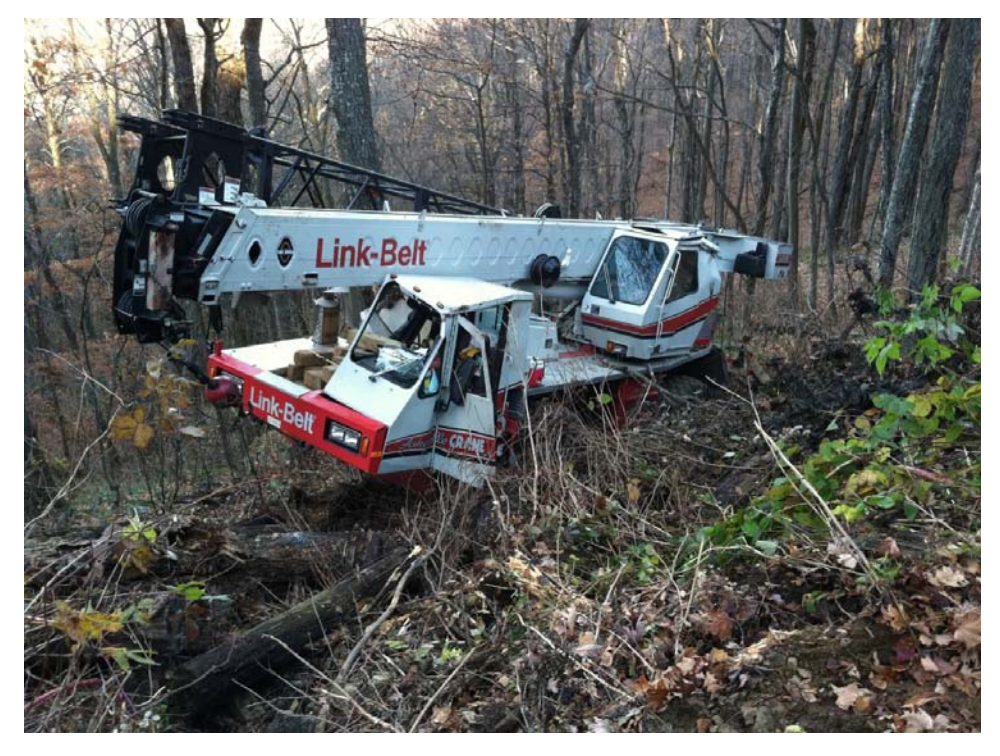
Photo #1: View of 2003 Linkbelt ATC-822, 22-ton, All-Terrain Crane SN: 71J35776, with 70' main and 45' jib.