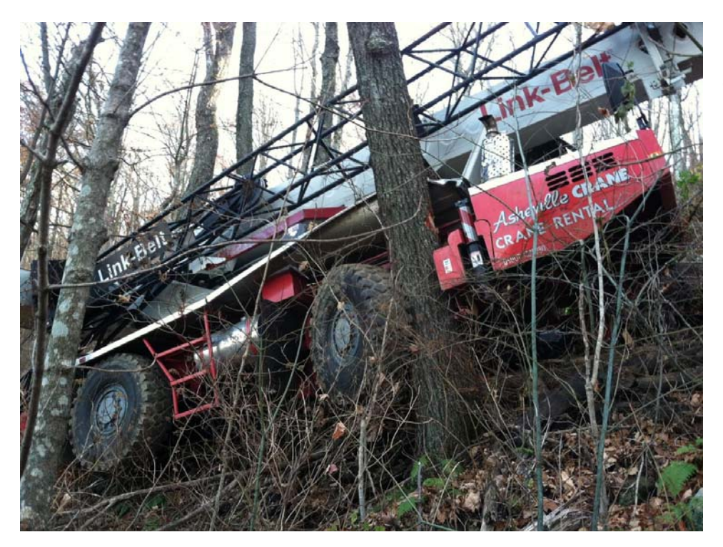
Photo #11: Right side view of boom truck lodged against tree on side of mountain.