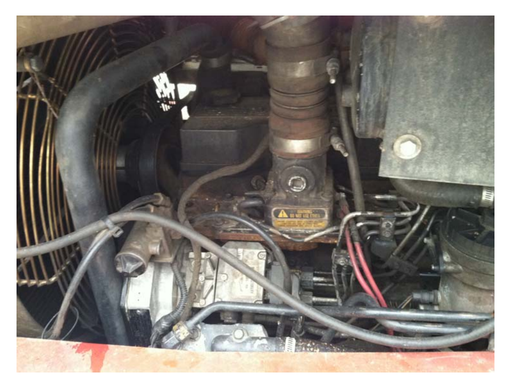
Photo #18: View of Cummins 6-cylinder, ISB series engine. No visible damage to engine.

Photo #17: Additional view of platform decking.